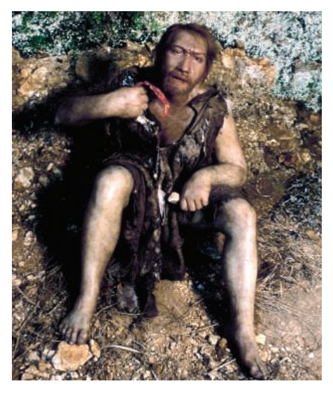
The good life. Did Neandertals find refuge from a harsh climate and modern humans along Gibraltar's lush coast?

One of the few things researchers agree on regarding the Neandertals is that the story of these European hominids ends in extinction. But just when the last Neandertal died, and whether modern humans or a changing climate sealed their fate, are matters of lively debate ( Science , 14 September 2001, p. 1980). Now a team working at Gibraltar, at the southern tip of Spain, reports radiocarbon dates suggesting that some Neandertals survived thousands of years longer than previously thought, taking refuge in southern Europe where the climate and environment were favorable, and where moderns were still fairly